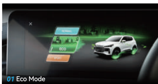
01 Eco Mode

Engine Power Engine Torque 147 Ps 210 Nm