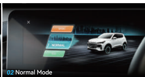
02 Normal Mode