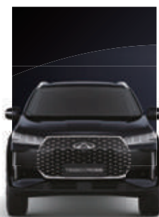
Carbon Crystal Black